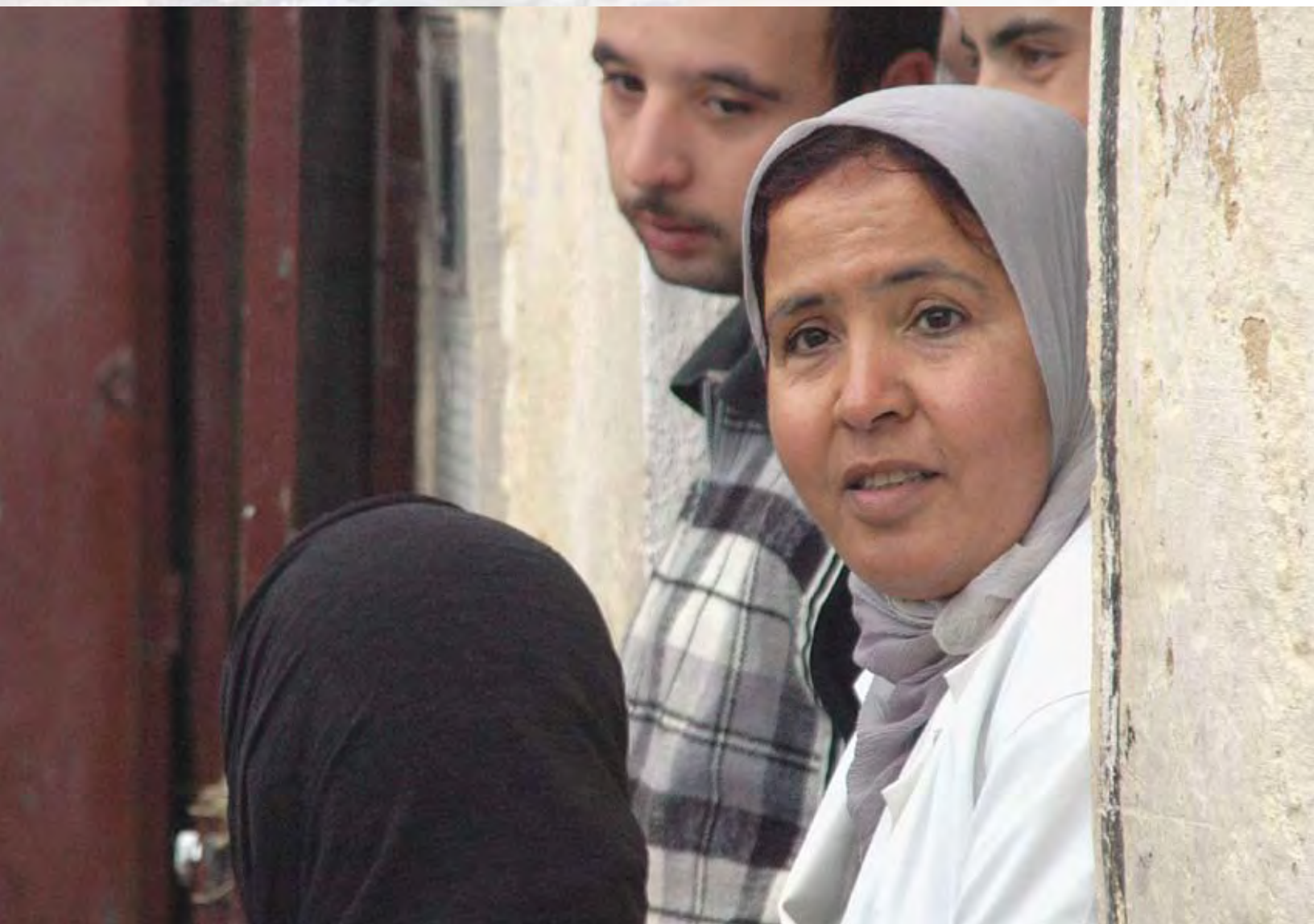
The predominant religion in North Africa is Islam, and it is illegal for a Muslim to convert to another religion.